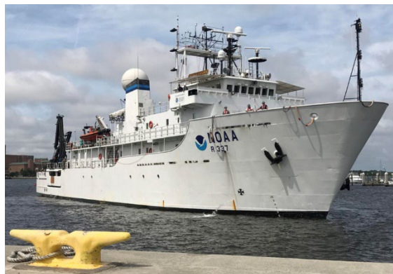
Figure: The Okeanos Explorer .